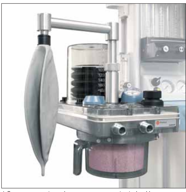
† Covers, manometer and oxygen sensor are not autoclavable